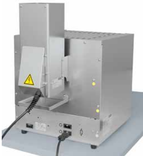
Standard laboratory muffle furnace L 5/11 with catalyst KAT 50 see page 12

For exhaust gas cleaning, in particular in debinding, Nabertherm offers exhaust gas cleaning systems tailored to the process. The afterburning system is permanently connected to the exhaust gas fitting of the furnace and accordingly integral part of the control system and the safety matrix of the furnace. For existing furnaces, independent exhaust gas cleaning systems are also available that can be separately controlled and operated.