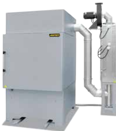
Chamber furnace NA 500/65 DB200 with catalytic post combustion system